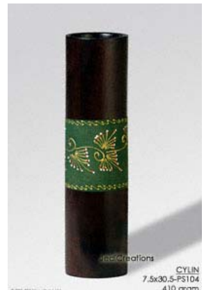
CYLIN 7.5x30.5-PS104 mango wood vase