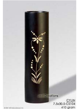
CYLIN 7.5x30.5-CS104 mango wood vase