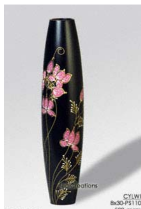
CYLWI 8x30-PS110 mango wood vase