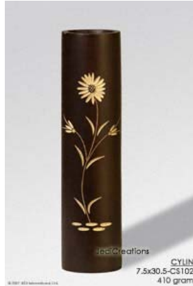
CYLIN 7.5x30.5-CS102 mango wood vase