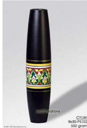
CYLWI 8x30-PS102 mango wood vase