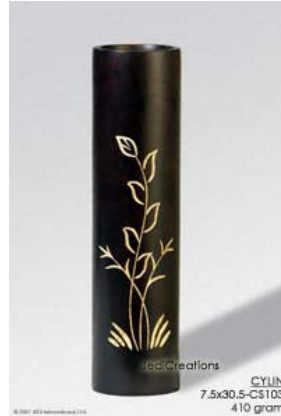
CYLIN 7.5x30.5-CS103 mango wood vase