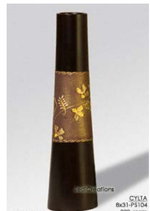
CYLTA 8x31-PS104 mango wood vase