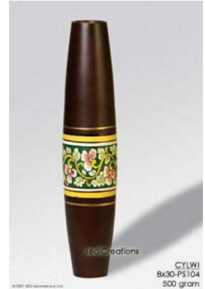
CYLWI 8x30-PS104 mango wood vase