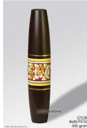
CYLWI 8x30-PS103 mango wood vase