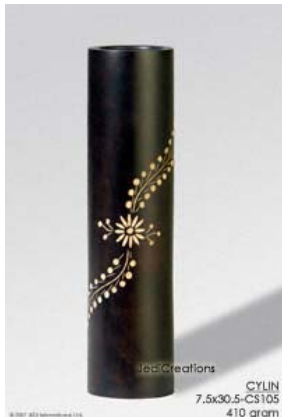
CYLIN 7.5x30.5-CS105 mango wood vase