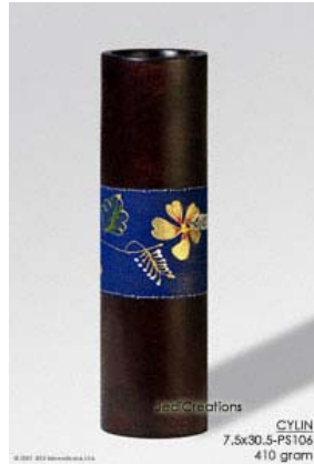
CYLIN 7.5x30.5-PS106 mango wood vase