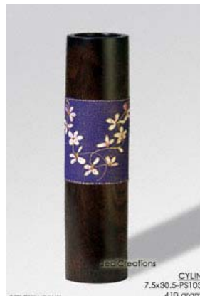
CYLIN 7.5x30.5-PS103 mango wood vase