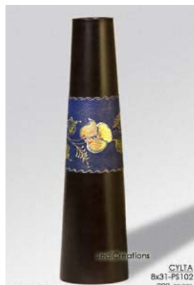
CYLTA 8x31-PS102 mango wood vase