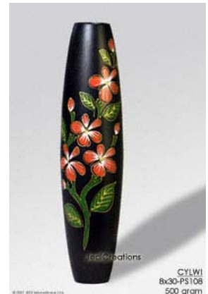
CYLWI 8x30-PS108 mango wood vase