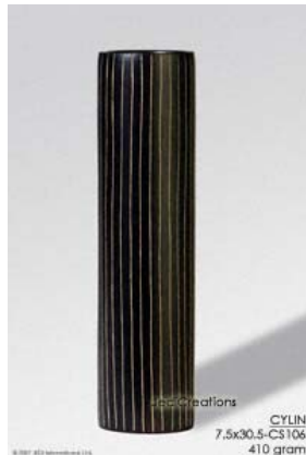
CYLIN 7.5x30.5-CS106 mango wood vase