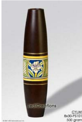
CYLWI 8x30-PS101 mango wood vase