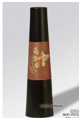
CYLTA 8x31-PS103 mango wood vase