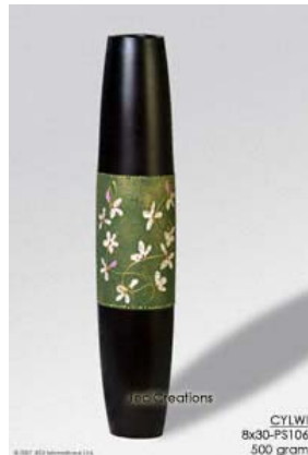
CYLWI 8x30-PS106 mango wood vase