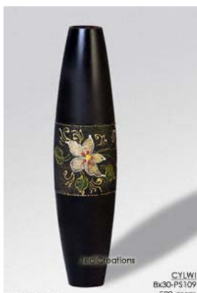
CYLWI 8x30-PS109 mango wood vase