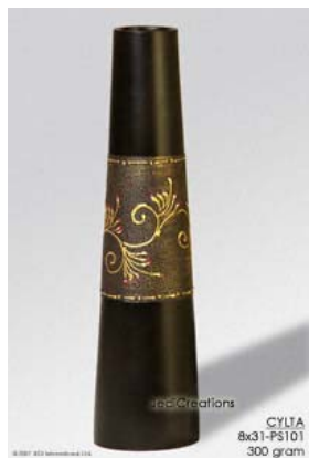
CYLTA 8x31-PS101 mango wood vase