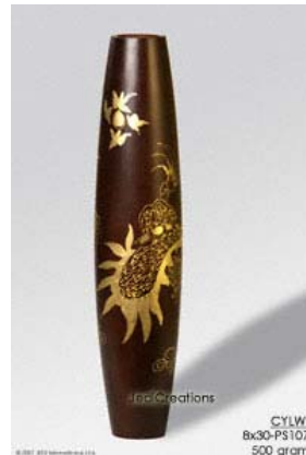
CYLWI 8x30-PS107 mango wood vase