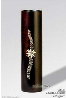
CYLIN 7.5x30.5-CS101 mango wood vase