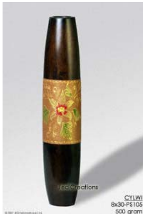
CYLWI 8x30-PS105 mango wood vase