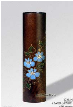
CYLIN 7.5x30.5-PS101 mango wood vase