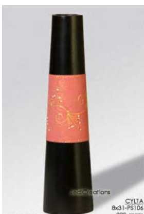
CYLTA 8x31-PS105 mango wood vase