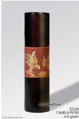
CYLIN 7.5x30.5-PS105 mango wood vase