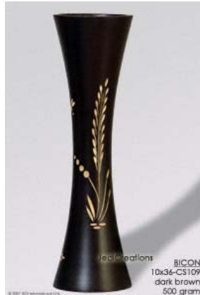
BICON 10x36-CS109 dark brown