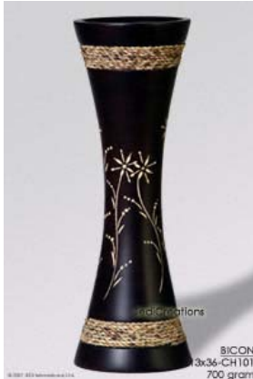
BICON 13x36-CH101 mango wood vase