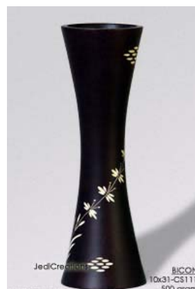
BICON 10x31-CS111 mango wood vase