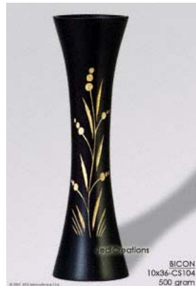
BICON 10x36-CS104 mango wood vase