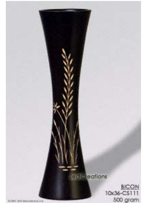
BICON 10x36-CS111 mango wood vase