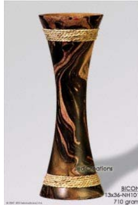
BICON 13x36-NH101 mango wood vase