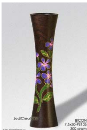
BICON 7.5x30-PS105 mango wood vase