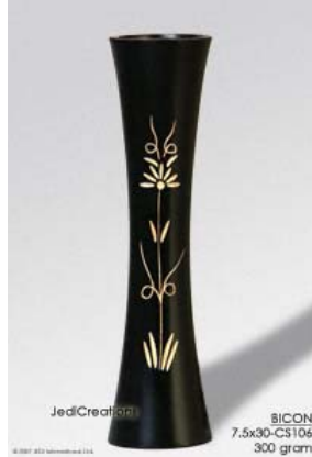
BICON 7.5x30-CS106 mango wood vase