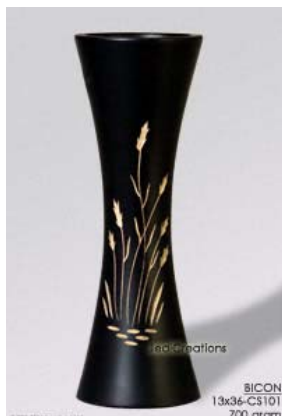
BICON 13x36-CS101 mango wood vase