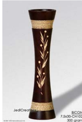
BICON 7.5x30-CH102 mango wood vase