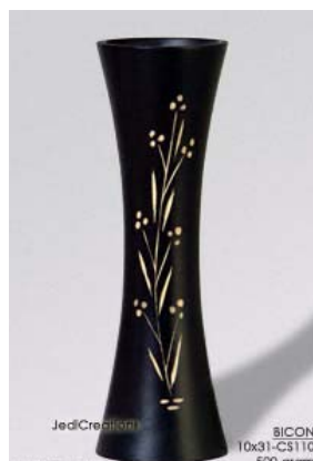
BICON 10x31-CS110 mango wood vase