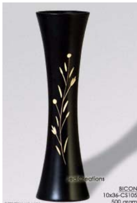
BICON 10x36-CS105 mango wood vase