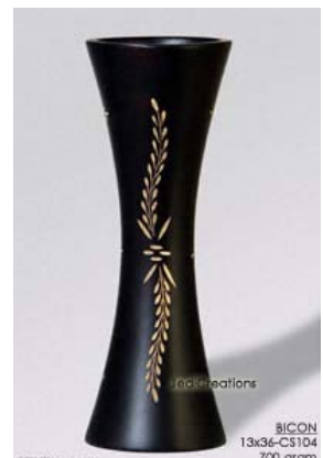
BICON 13x36-CS104 mango wood vase