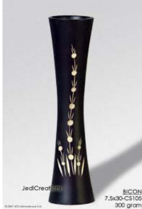
BICON 7.5x30-CS105 mango wood vase