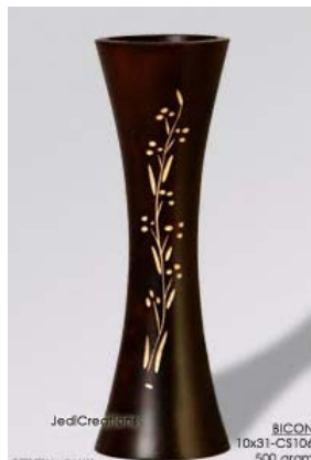
BICON 10x31-CS106 mango wood vase