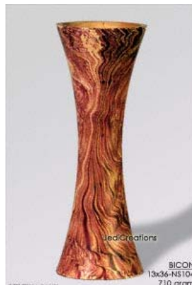
BICON 13x36-NS104 mango wood vase