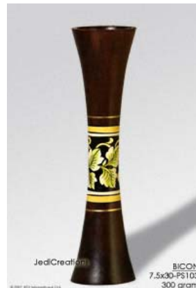
BICON 7.5x30-PS103 mango wood vase