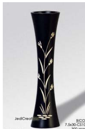
BICON 7.5x30-CS103 mango wood vase