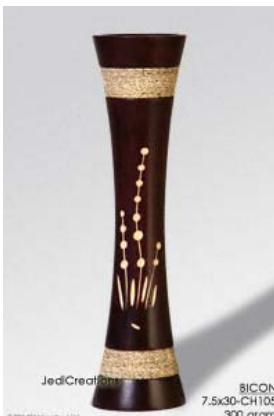
BICON 7.5x30-CH105 mango wood vase