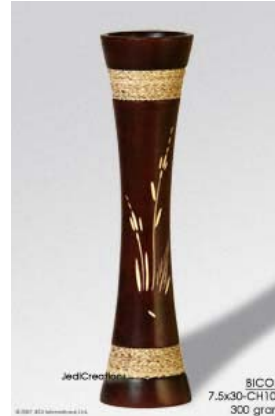
BICON 7.5x30-CH103 mango wood vase