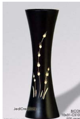
BICON 10x31-CS107 mango wood vase