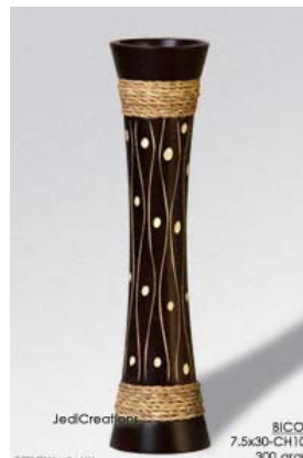
BICON 7.5x30-CH107 mango wood vase