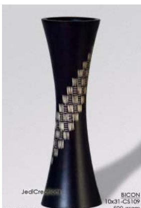
BICON 10x31-CS109 mango wood vase