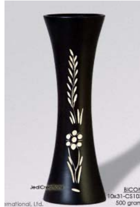
BICON 10x31-CS103 mango wood vase