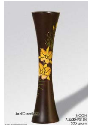
BICON 7.5x30-PS104 mango wood vase