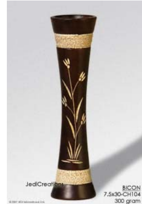
BICON 7.5x30-CH104 mango wood vase