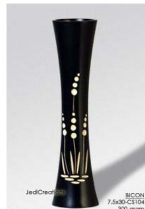
BICON 7.5x30-CS104 mango wood vase