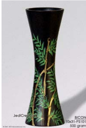
BICON 10x31-PS101 mango wood vase