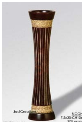
BICON 7.5x30-CH106 mango wood vase