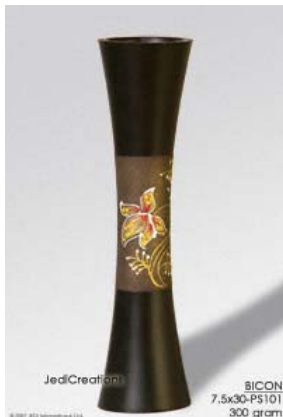
BICON 7.5x30-PS101 mango wood vase