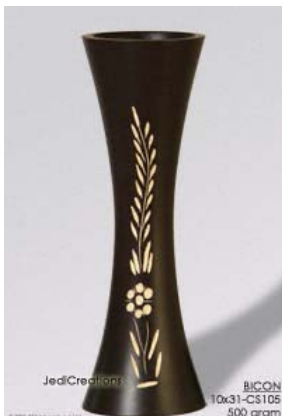
BICON 10x31-CS105 mango wood vase