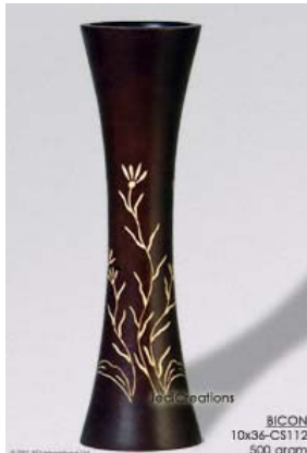
BICON 10x36-CS112 mango wood vase