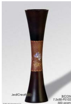
BICON 7.5x30-PS102 mango wood vase