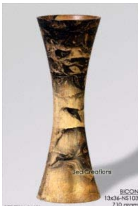
BICON 13x36-NS103 mango wood vase