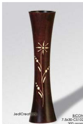
BICON 7.5x30-CS102 mango wood vase