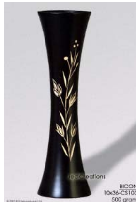
BICON 10x36-CS103 mango wood vase