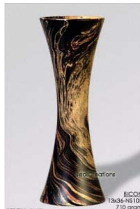
BICON 13x36-NS105 mango wood vase

As handmade and natural items, sizes, weights, carvings, colors and painted designs may vary. In order to show each vase best, each photograph uses its own scale, so sizes should not be compared visually.