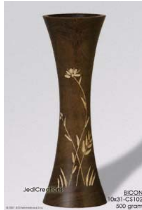
BICON 10x31-CS102 mango wood vase