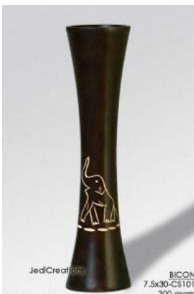
BICON 7.5x30-CS101 mango wood vase