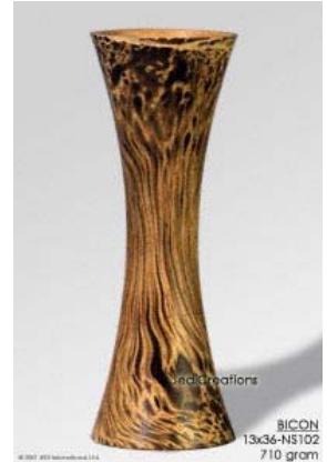
BICON 13x36-NS102 mango wood vase