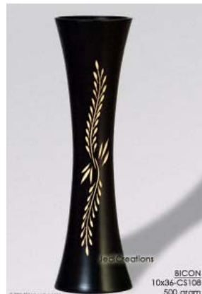
BICON 10x36-CS108 mango wood vase