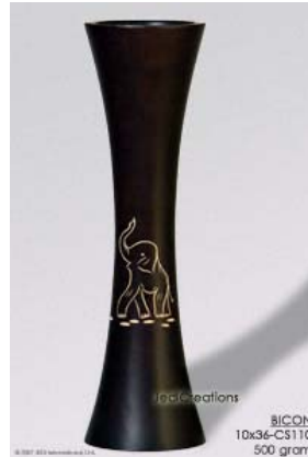
BICON 10x36-CS110 mango wood vase