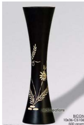
BICON 10x36-CS106 mango wood vase