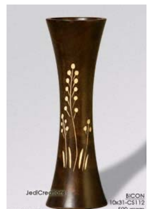
BICON 10x31-CS112 mango wood vase