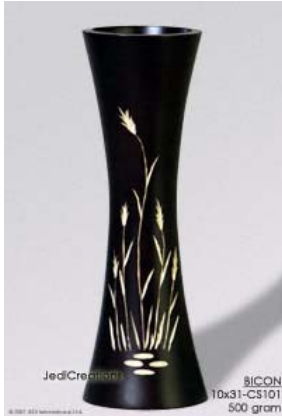
BICON 10x31-CS101 mango wood vase