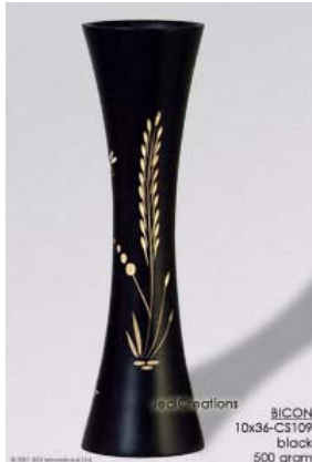
BICON 10x36-CS109 black