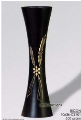
BICON 10x36-CS101 mango wood vase