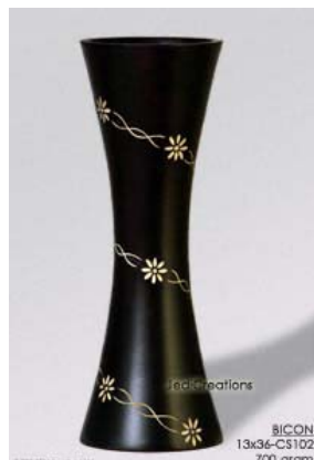
BICON 13x36-CS102 mango wood vase