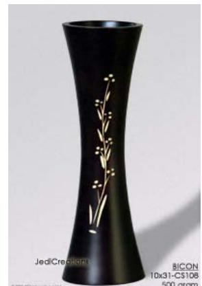
BICON 10x31-CS108 mango wood vase