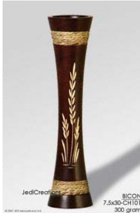
BICON 7.5x30-CH101 mango wood vase