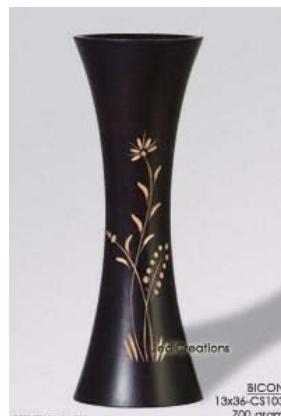
BICON 13x36-CS103 mango wood vase