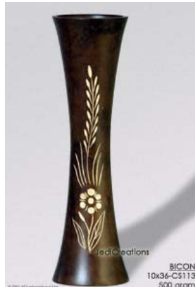
BICON 10x36-CS113 mango wood vase