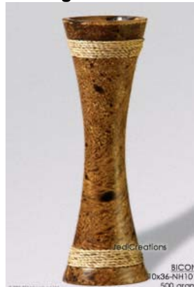
BICON 10x36-NH101 mango wood vase