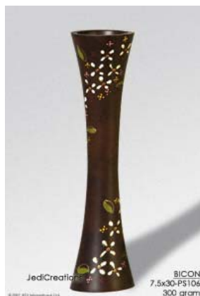
BICON 7.5x30-PS106 mango wood vase