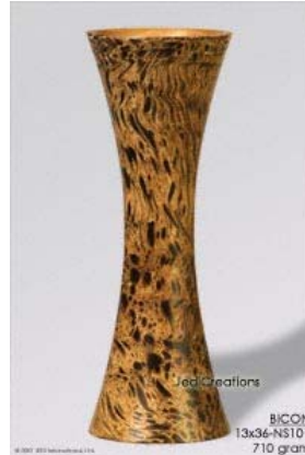
BICON 13x36-NS101 mango wood vase