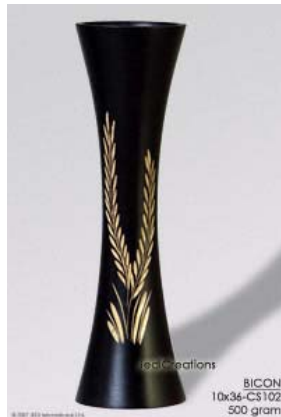
BICON 10x36-CS102 mango wood vase